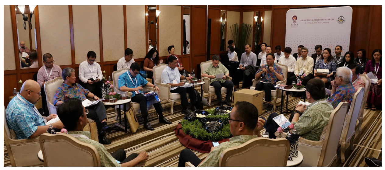
The ASEAN Digital Ministers' Retreat was held on 28-29 March 2019 in Phuket, Thailand, to discuss the future of digital ASEAN and implications to regional initiatives on ICT and telecommunications.

On transport, ASEAN stepped up efforts in advancing sustainable transport by publishing three documents that were adopted by the ASEAN Transport Ministers at the 24<sup>th</sup> ASEAN Transport Ministers' Meeting on 8 November 2018, namely the ASEAN Regional Strategy on Sustainable Land Transport, the ASEAN Fuel